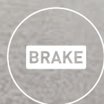
Available Forward Collision Warning system