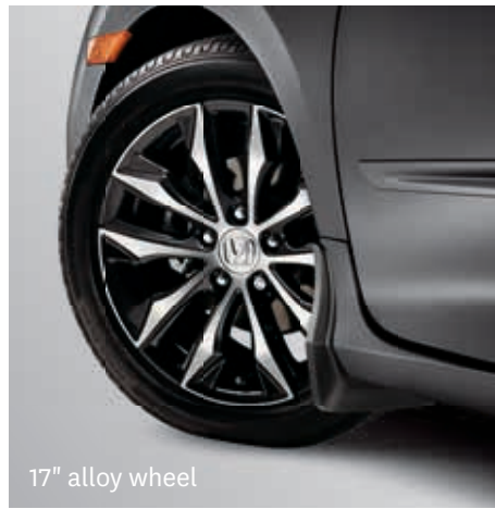
17" alloy wheel