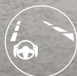
Available Lane Departure Warning system