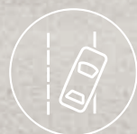
Available Road Departure Mitigation system