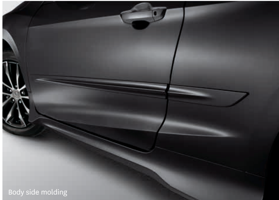
Body side molding