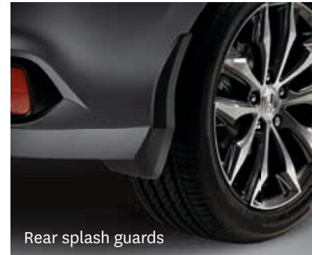
Rear splash guards