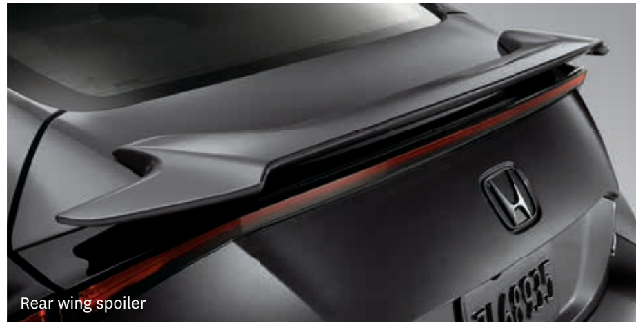
Rear wing spoiler