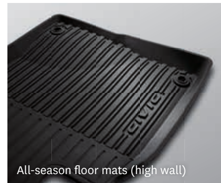
All-season floor mats (high wall)