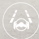
Available Lane Keeping Assist System