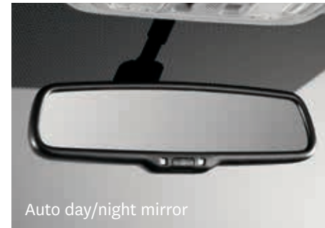
Auto day/night mirror