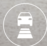
Available Adaptive Cruise Control with Low-Speed Follow