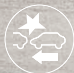
Available Collision Mitigation Braking System™