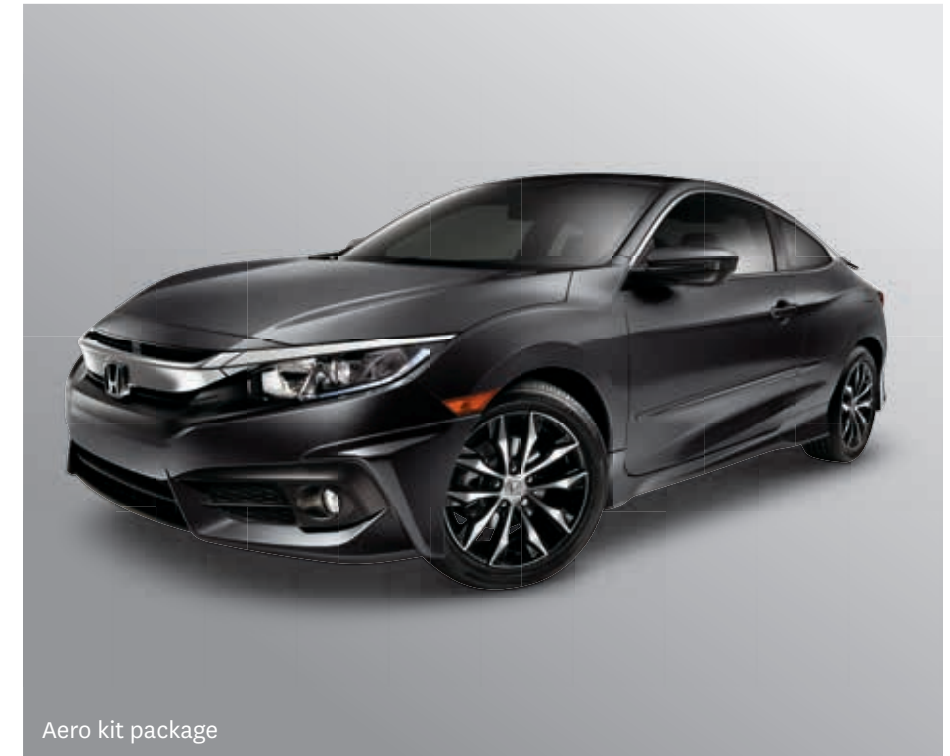
Aero kit package